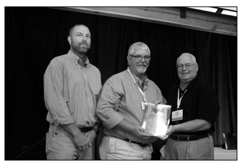
The Greer Commission of Public Works was recently awarded the Gold System Operational Achievement Recognition award by the American Public Gas Association.

Greer CPW is one of six companies in the United States to receive the award this year and out of 202 possible points, Greer CPW received 197 from the APGA Operations and Safety Committee. Gas