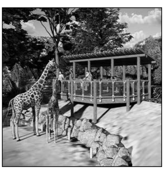
The Greenville Zoo was recently awarded $1 million in state funds to upgrade, renovate and expand animal exhibits.

"This funding allocation from the State budget reaffirms the importance of the Greenville Zoo to our community and to South Carolina," Councilwoman