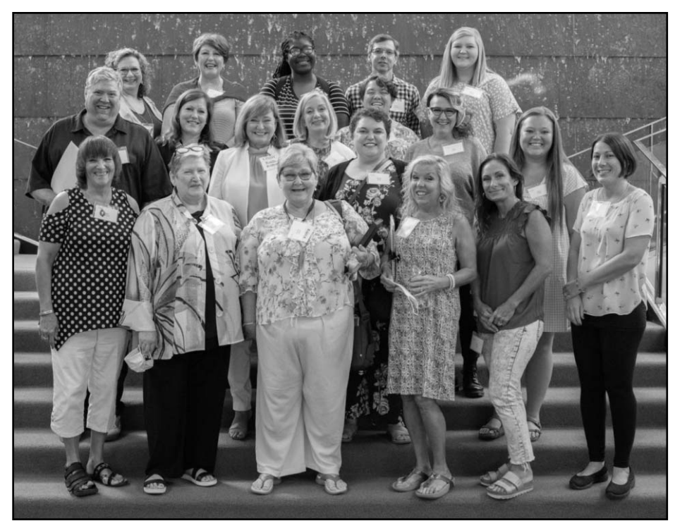
In June, Chapman Cultural Center led its 28th year of the Muse Machine STEAM Teachers Institute. As part of the Institute, educators from across the state participate in the week-long training that focuses on incorporating the arts into classrooms of various disciplines.