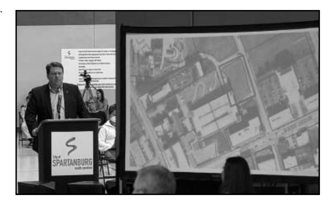
The 83,000 square foot building is planned for the Liberty Street lot adjacent to the St. John Street parking garage. City of Spartanburg

The planned development marks a major win for local economic development leaders who've