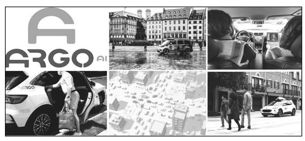
Argo Al works globally with such top brands as Ford, Volkswagon, Lyft and Walmart.

Argo will establish a closed-course track in the