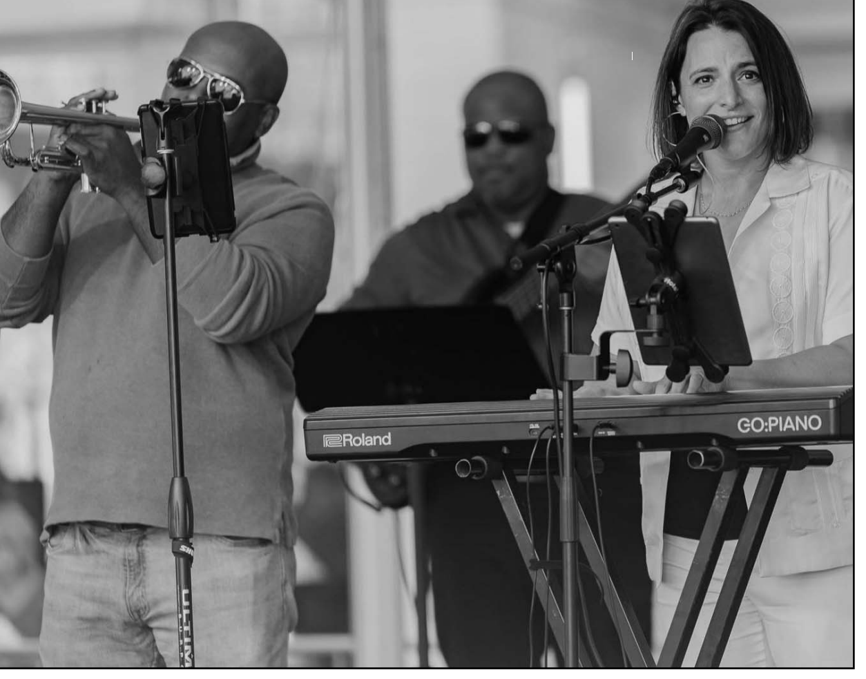
Greenville's inaugural Jazz Fest will be held June 3, and feature national acts.