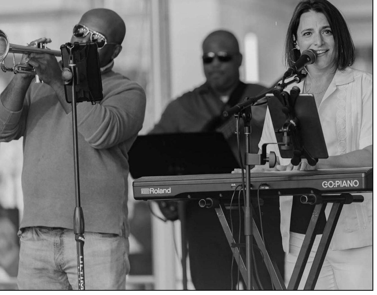
Greenville's inaugural Jazz Fest will be held June 3, and feature national acts.