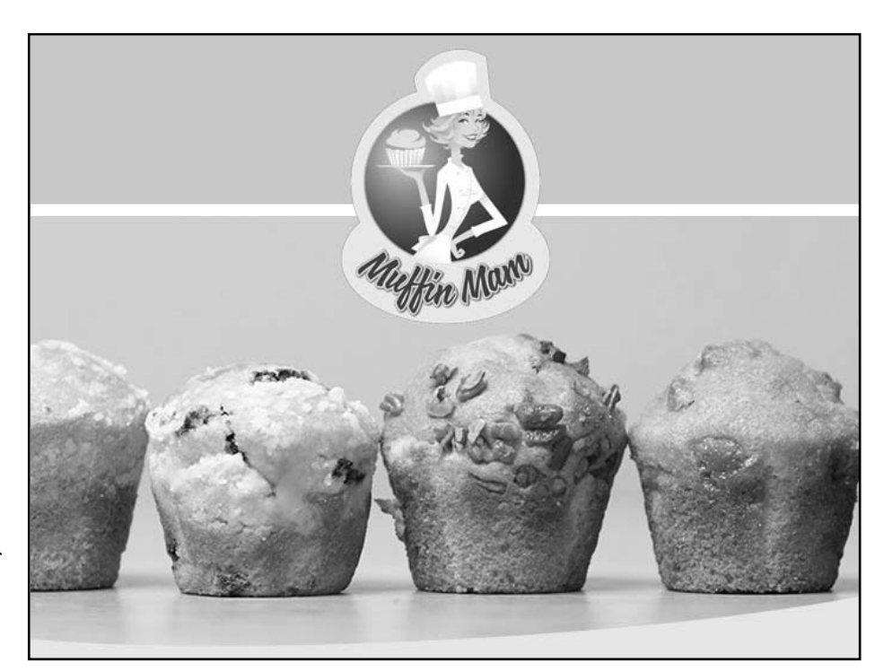
Simpsonville-based company The Muffin Mam, Inc. is launching new production operations in Laurens County.

"Our new Laurens County facility will house high-capacity baking equipment, which will produce muffins, cupcakes, pound cakes, crème cakes and more, all sold across the United States and internationally through leading retail grocers and food service channels. The new facility will complement our existing facility in Simpsonville, and allow us to better serve our cus-