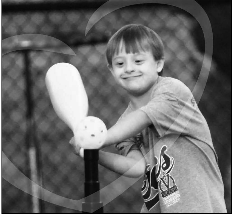
The Carolina Miracle League recently began its 2019 spring season.