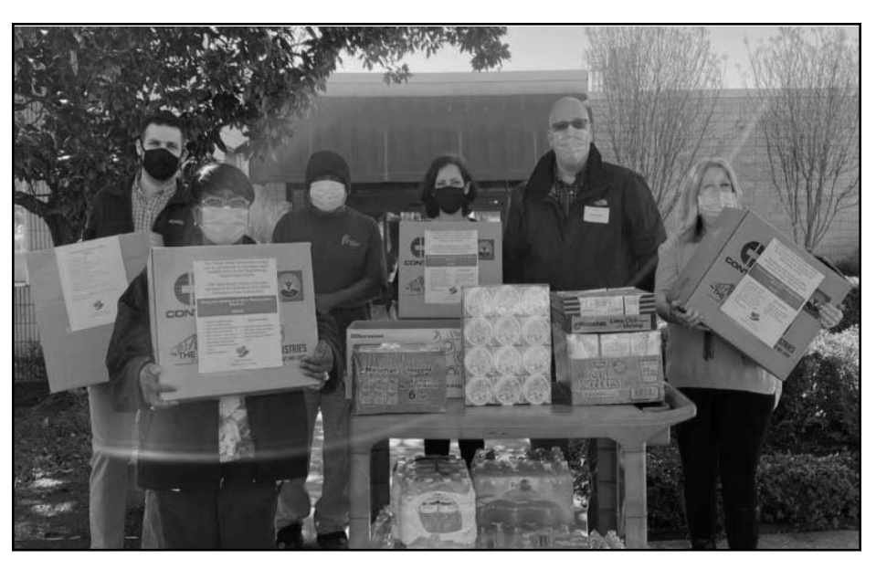
Spartanburg Opportunity Center volunteers helping the homeless

Hub City Press recently announced it will publish Halle Hill's debut story collection Good Women: Stories . A collection of reckoning, Good Women follows the lives of sixteen Black women through Appalachia and the Deep South, examining the shaping of their realities. Considering their foundations in generational trauma, Hill observes how place, blood-ties, desperation, obsessions, and boundaries (or lack thereof), influence the navigation of their worlds. As these women wrestle with need, they find themselves in mundane, painfully ordinary experiences that are steeped with resiliency, humor, and privately long for witness.