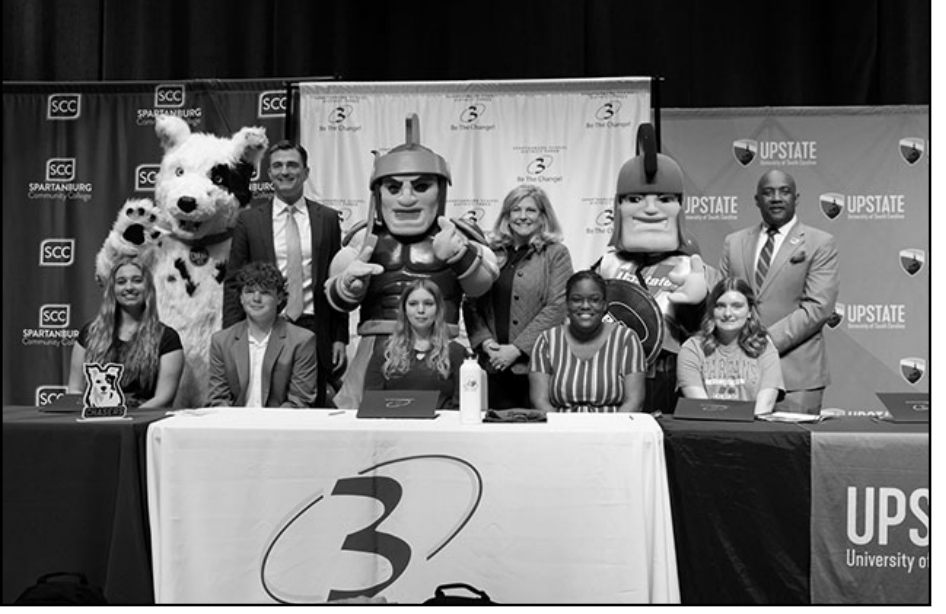
Spartanburg Community College, Spartanburg School District 3 and USC Upstate recently partnered to create the first Teacher Pathway Program for high school students in Spartanburg County.