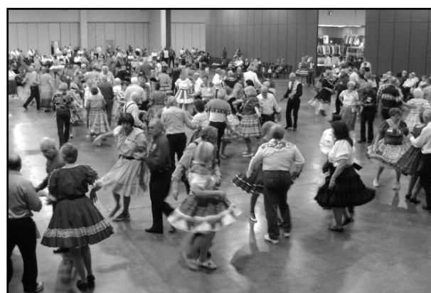
The Spartan Spinners participate in large national festivals in Gatlinburg, Myrtle Beach and other areas.

learned the calls, they have an inexpensive means of exercising and partying with friends on Saturday night. New dancers are able to join the regular dance on Saturday nights after completing the first few weeks of lessons.