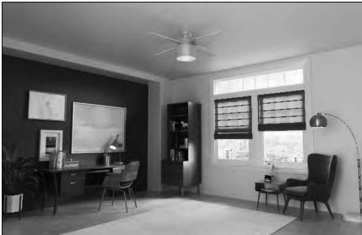
Cranbrook in Dove Grey by Hunter Fan Company.

Tip 1: Design a space where you'll enjoy spending time. Simple touches like lighting, a bright touch of paint or a wide-open window, can help create an inviting ambiance, and so can the addition of certain accessories. Instead of opting for a simple ceiling light fixture, dare to add a pop of style and color with a new ceiling fan. Not only can this addition make your space more comfortable, it can elevate your décor, with the ceiling as the centerpiece. Options from Hunter Fan Company