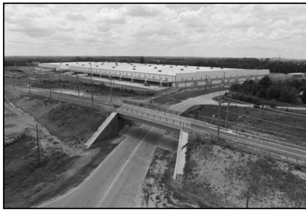
BMW opened its new logistics center on Thursday, September 29.

A unique feature of the logistics center is that it is divided in the middle by a fence, separating the new Container Freight Station from BMW's Foreign Trade Zone (FTZ). Parts and goods, both duty-paid and duty-unpaid, enter the warehouse on one side to be separated. The duty-paid material is cross-docked and travels by truck to BMW's Consolidated