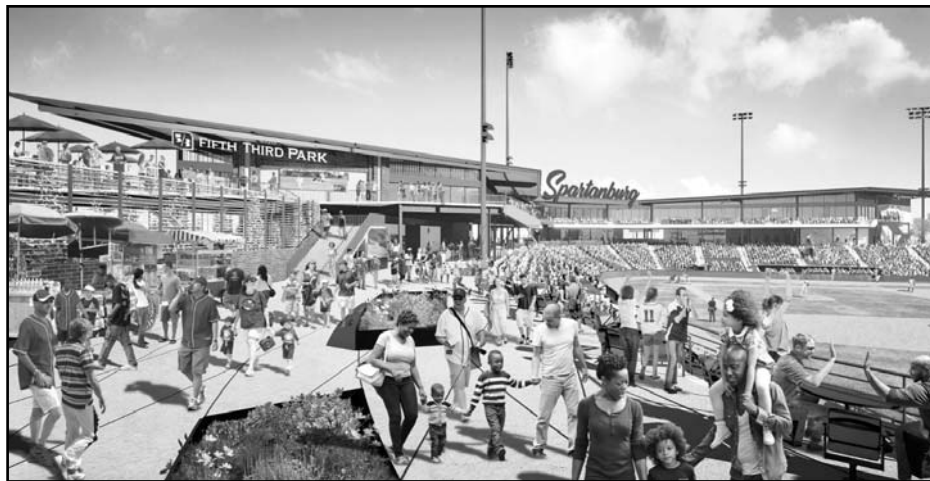
On November 1, Spartanburg broke ground on a new minor league baseball stadium at 149 S. Daniel Morgan Avenue. The stadium is a $75 million centerpiece of a mixed-use project for the city.

This edition of Caffeinated Conversations will take place on Tuesday, November 14, 8:30 a.m. to 9:30 a.m. at OneSpartanburg, Inc.'s Milliken Board Room, 105 North Pine Street, Spartanburg. Register for this event online at https://spartanburgareasc.chambermaster.com/events/