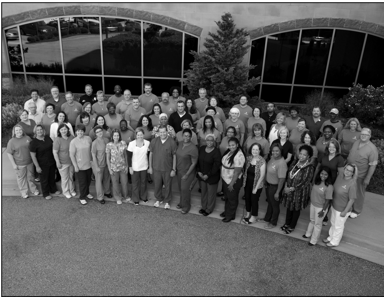
Pelham Medical Center was recently chosen as one of 100 companies named The Best Places to Work in Healthcare in 2016 by Modern Healthcare.