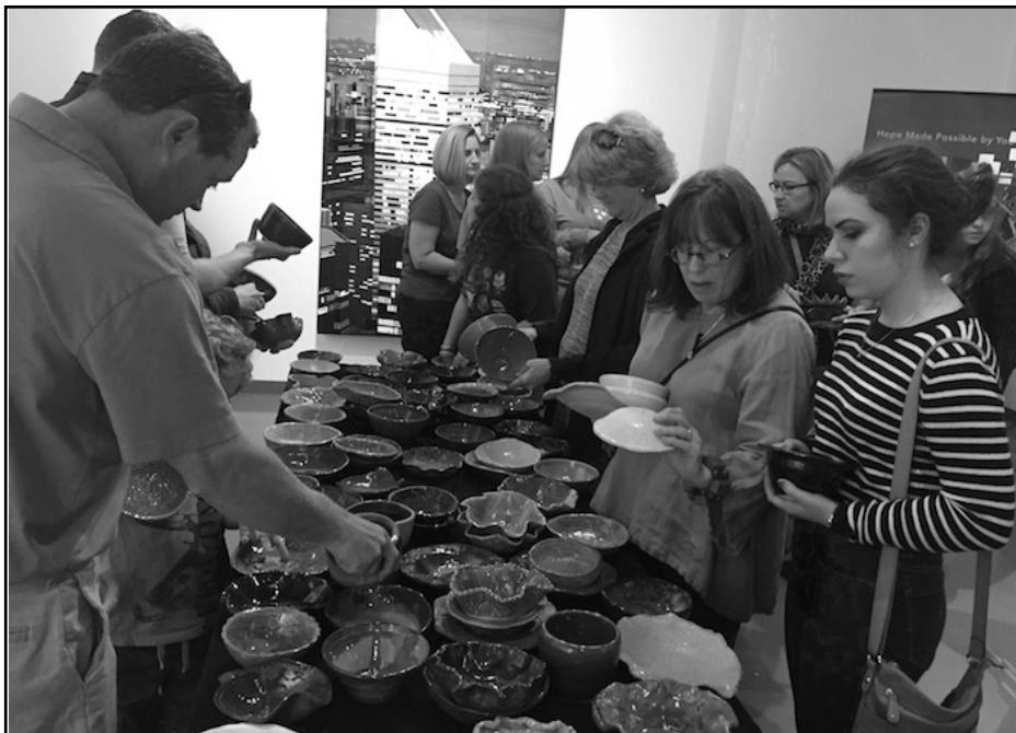
Carolina Clay Artists will donate $33,000 to TOTAL Ministries as a result of the 2016 Hub City Empty Bowls project.

Finally, Vulcan's donation supports GSSM's STEM-centered satellite day camps for rising 7 - 9th graders in Greenville County for two weeks during the summer. iTEAMS Xtreme: Next Generation focuses on science, technology and robotics, while CREATEng is a project-based camp that encourages students to apply principles of engineering to solve challenges.