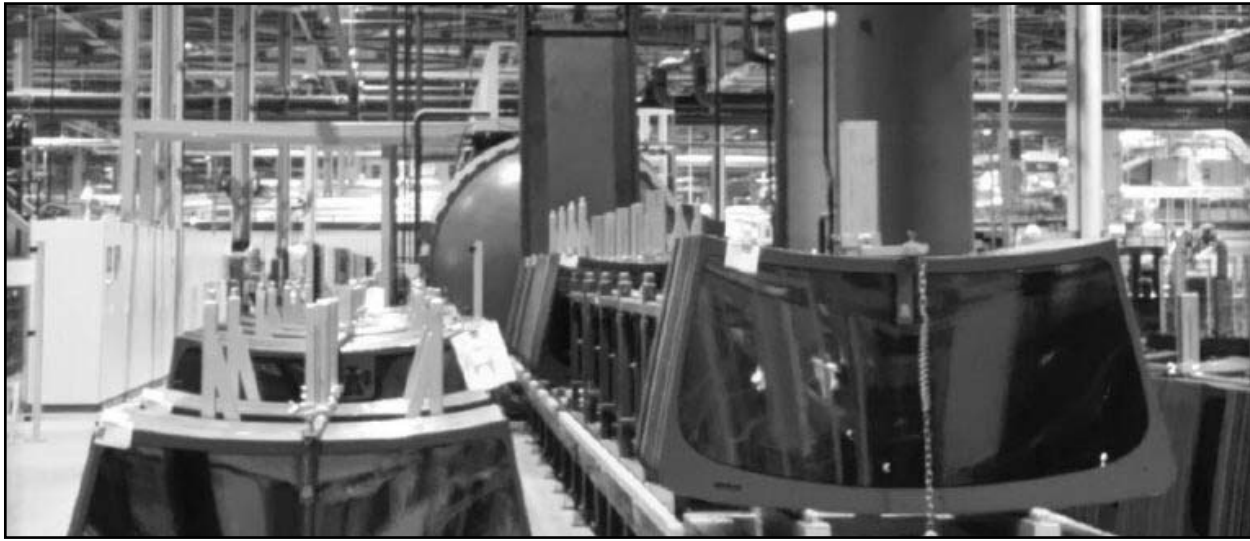
Fuyao Glass America recently announced a $34.5 million expansion to its Fountain Inn location which will add 121 new jobs.

"We are excited to expand our manufacturing footprint in Greenville County and the Upstate, a key region for the automotive industry. This expansion will strengthen our relationship with our customers and accommodate increased demand of our products," stated Fuyao