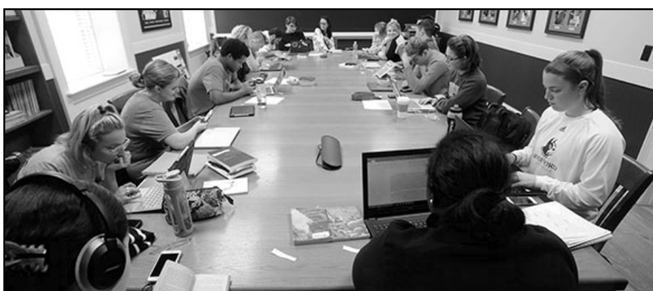
Wofford students have spent a lot of time writing during January.