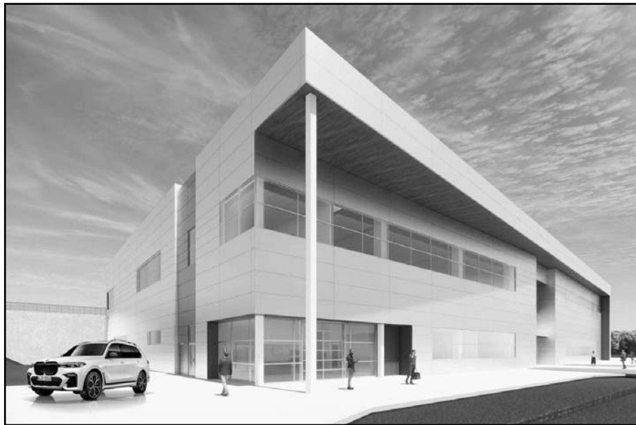
BMW Manufacturing broke ground on a new $20 million, 67,000 square-foot training center on February 22.

For more information, please visit: ArtistsCollectiveSpartanburg.org .