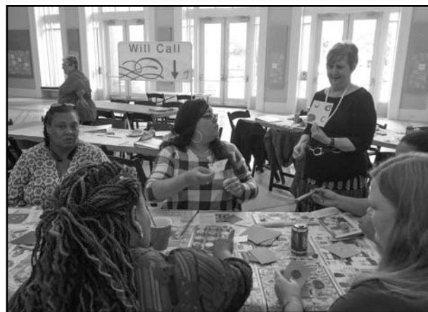
Chapman Cultural Center recently hosted 29 teachers in their new training program for early educators.

and CEO at Chapman Cultural Center, says: "Being prepared for kindergarten is key to educational success for all children and research shows that arts education in preschool increases kindergarten readiness and reduces chronic absenteeism. Over the last forty years, we have provided the K-12 students and teachers of Spartanburg County with an arts advantage that other counties do not have. We're extending this training to include early childcare providers so that even our youngest children will have access to quality arts education."