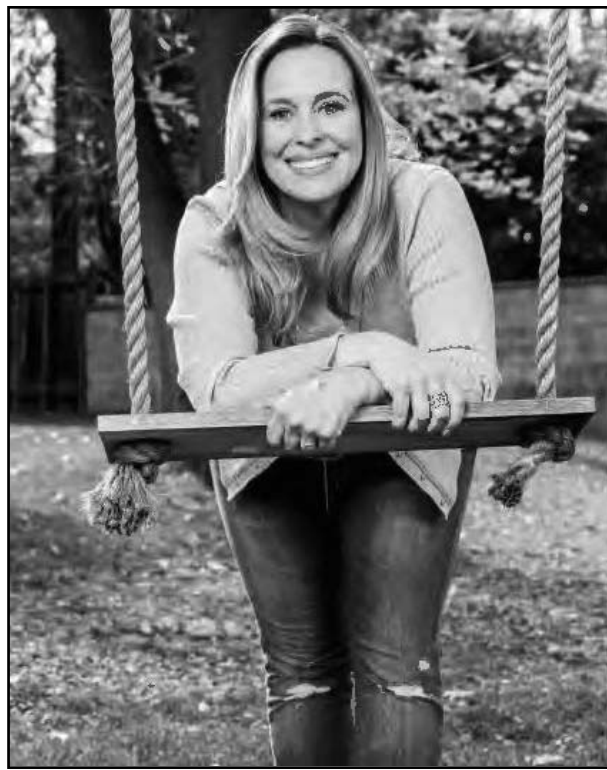
Genie Francis, soap star and Nutrisystem ambassador.

• Take a Small Scoop of Coleslaw: Even if it's made with high-fat mayonnaise, one serving (around three ounces) is only about 172 calories and has two grams of fiber (thank you cabbage!), according to the U.S. Department of Agriculture. Better yet, make your own and bring it with you -- just swap in low-calorie mayo for the regular variety or do a