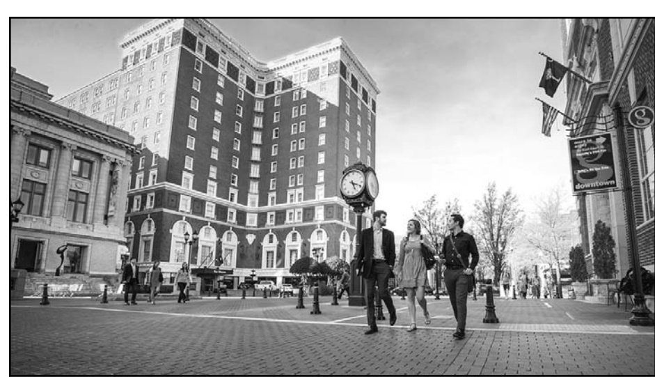
The study found that Furman supports a total of 2,176 jobs in Greenville County and an additional 57 jobs in the surrounding counties.

The study was conducted by Furman Associate Professor of Economics