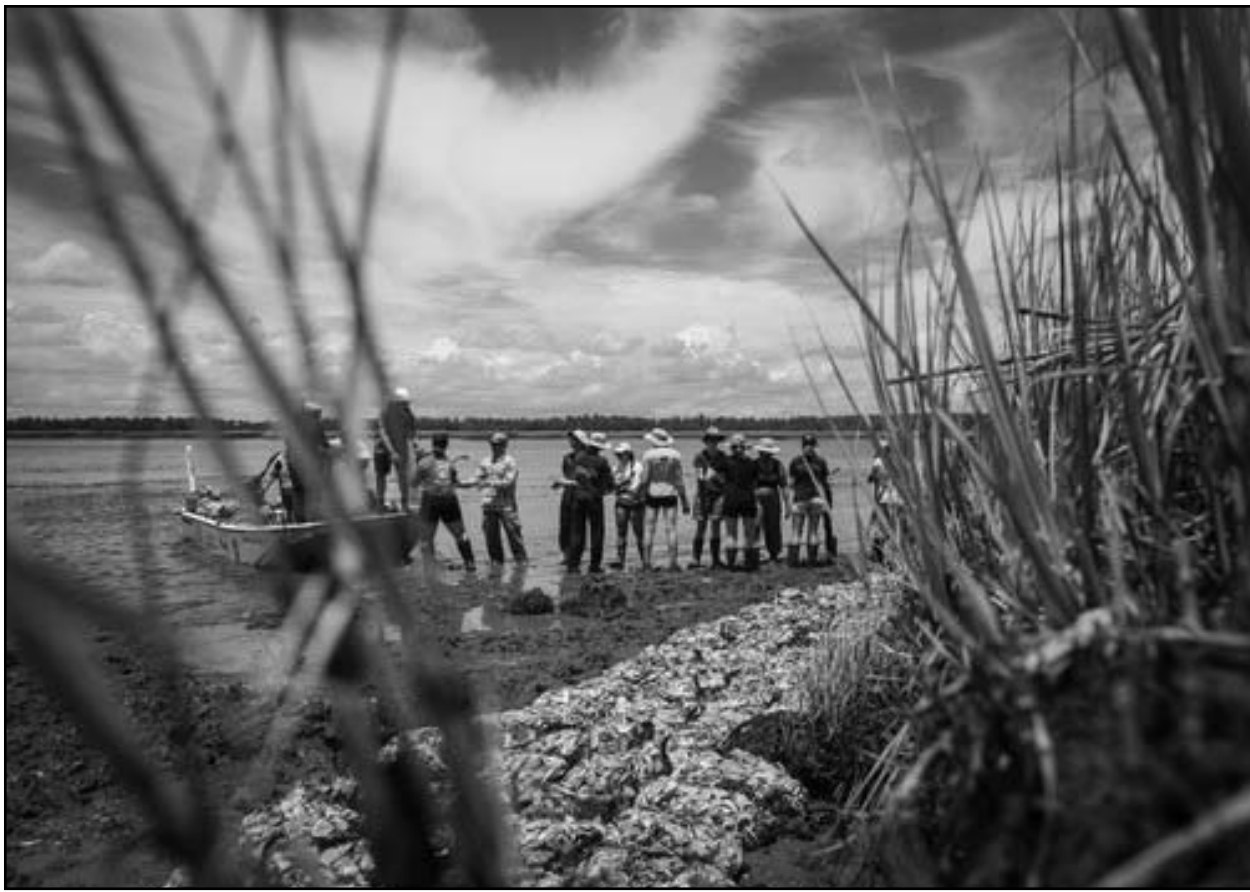
Volunteers form an assembly line to move bags of oyster shells into place along the shoreline. This is one of several strategies that will be employed at Parris Island to improve the natural infrastructure of the area’s shorelines.