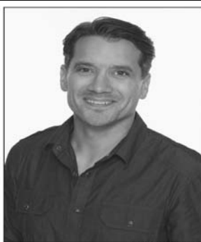
Dominic Zamprogna is “Dante” on “General Hospital.”

The Hook attacked again. Nikolas confided in Liz. Spencer was stunned. Dante opened up to Sam. Carly and Drew celebrated. Cameron and Scott got caught up. Trina voiced her doubts. Nikolas and Liz put their heads together. Laura visited Ava, and Dante interrogated a patient at General Hospital. Martin took on a new client. Felicia made a suggestion to Cody. Liz