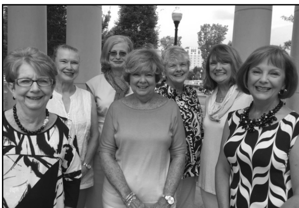
The Lady Slipper Garden Club installs officers for 2016-2017

The Lady Slipper Garden Club officers for the 2016-2017 year were installed recently. LSGC was organized in 1974 and is a member of National Garden Clubs, Inc.; South Atlantic Region, The Garden Club of SC, Inc.; and the East Piedmont District.