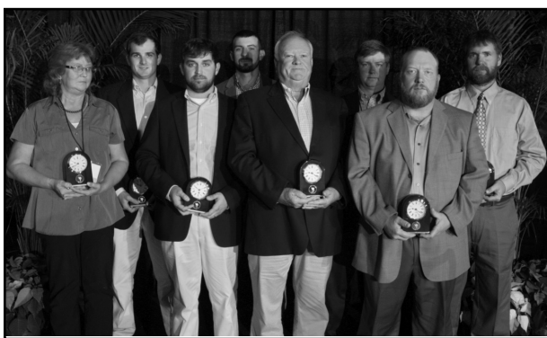
Spartanburg County volunteer named South Carolina Farm Bureau All-Star

The skilled providers of Interim Healthcare have served residents of Cherokee, Spartanburg, Greenville, Pickens, Anderson and Oconee Counties for nearly 40 years. The company provides in-home services for home nursing, therapy, senior care, supportive services and comprehensive hospice. All services are tailored to the medical and financial needs of each client and his or her family.