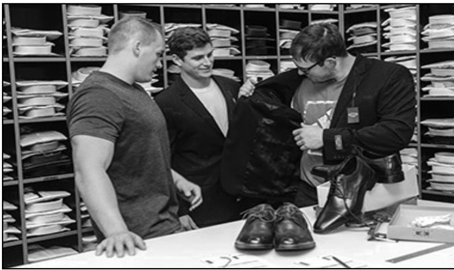
The 'Dress for Success' initiative, proposed by the Wofford Student Athlete Advisory Committee, is helping the school's student athletes who are applying for jobs, interviewing for graduate school or starting careers.