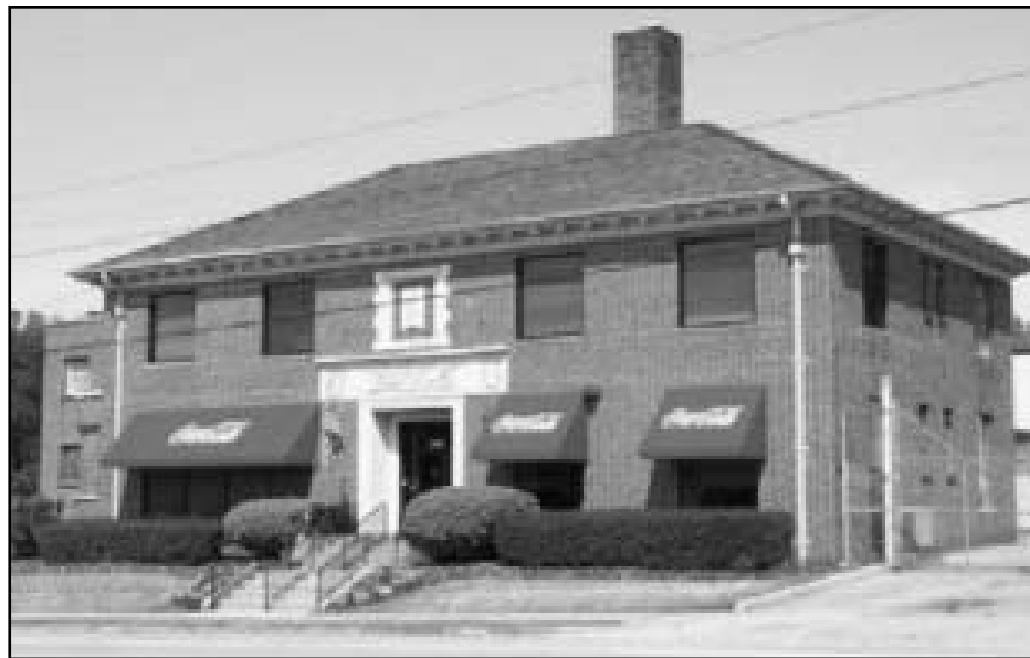
The former Coca-Cola distribution center located at 500 West Main Street in Spartanburg is going to be redeveloped into a mixed-use facility this spring.