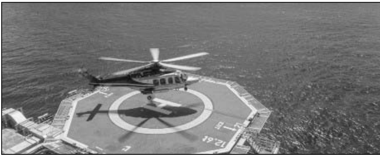
The NEXT Founders Fund's first investment will be to Safe Helipad, a software platform to help manage helipads, helidecks, and vertiports for safety and compliance.