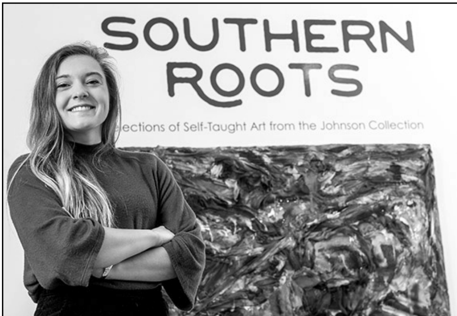
Internships with the Johnson Collection help art history majors prepare for life after Wofford.

Tickets for Ring of Fire: The Music of Johnny Cash can be purchased by calling the Chapman Cultural Center box office at (864) 542-2787 or by ordering online at www.chapmanculturalcenter.org . Tickets are $30 for adults, $27 for seniors and $20 for students.