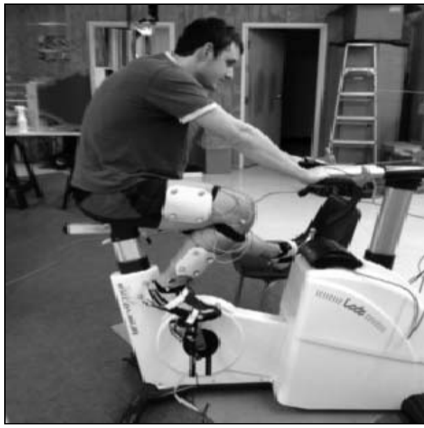
(Right) New research shows that peddling with one leg can be important to fine-tune ACL rehab.