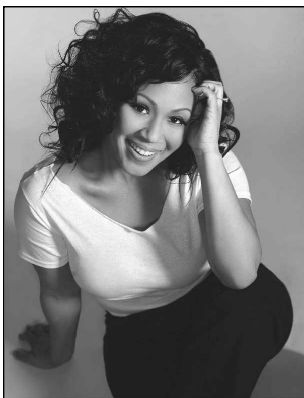
Grammy-award winning musical artist Erica Campbell will be the keynote speaker at the 2018 MLK Unity Celebration.

The City of Spartanburg and the United Way of the Piedmont have partnered to help further Dr. King's legacy. The Day of Service on Monday, January 15, is a living embodiment of Dr. King's belief that "Every-