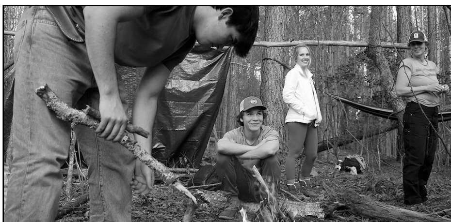
Students in the Bushcraft and Wilderness Survival at Glendale Interim course work on building a campfire during their overnight stay at Glendale Shoals.

This event will be held on Tuesday, March 7, 8:00 a.m. - 1:00 p.m. at 1881 Event Hall, 805 Spartan Boulevard, Spartanburg. Register at https://spartanburgareasc.chambermaster.com/events/