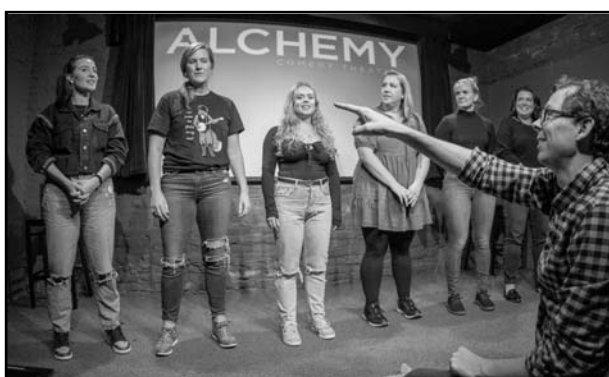
Alchemy Comedy will present their comedy show 'Humongous' on February 19 at 7:30 p.m.

Tickets for "Humongous" are on sale now and are expected to sell out quickly. Don't miss your chance to see one of Greenville's biggest comedy shows of the year.