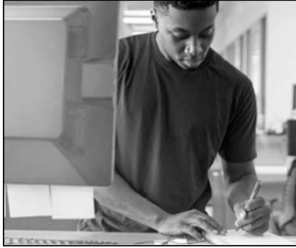
The GED Incentive Program offers anyone in South Carolina an opportunity to receive $500 for earning their GED for free through their local Adult Education Center.