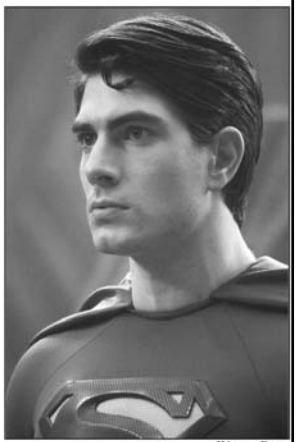
Brandon Routh in "Superman Returns"

A. "The Rifleman" is a classic Western that ran for five seasons from 1958 to 1963. It starred Chuck Connors as a rancher and Johnny Crawford as his young son, Mark. The number of shots that Connors fires during the opening credits appears to my ears to be 13.