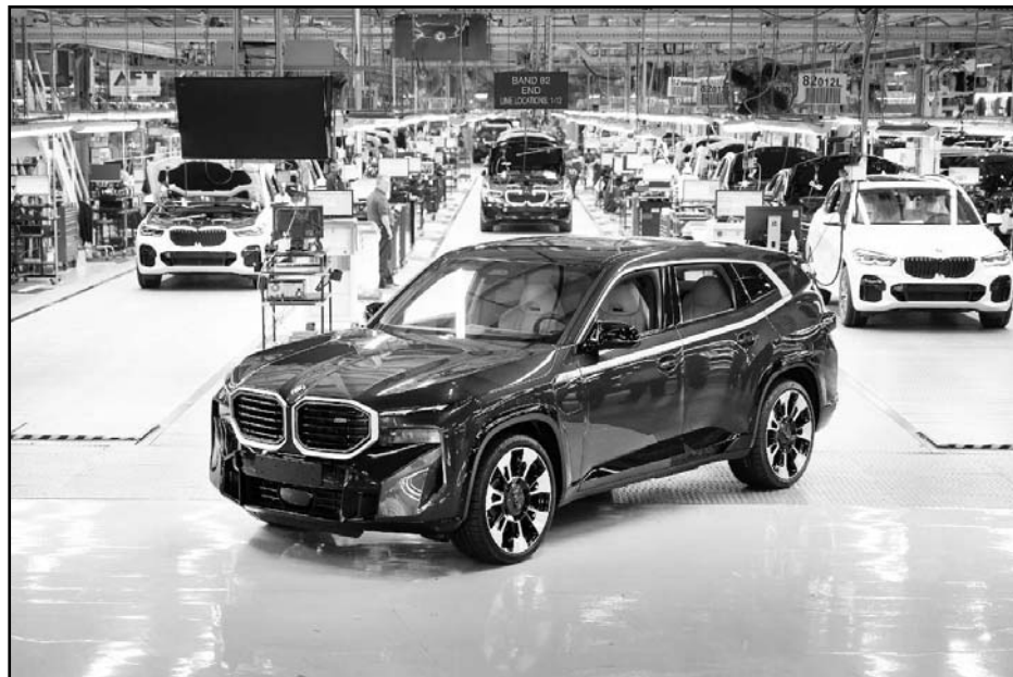
BMW Manufacturing's $1.7 billion investment in electric vehicle production, including a new, $700-million battery assembly plant in Woodruff, was a large part of Spartanburg County's 2022 success.