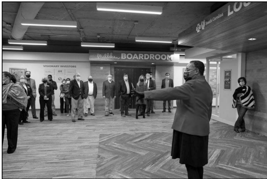
OneSpartanburg, Inc. landed 44 economic development projects in 2021.

Purchase online at: https://www.ticketmaster.com/event/2D005B8DACC91DF9