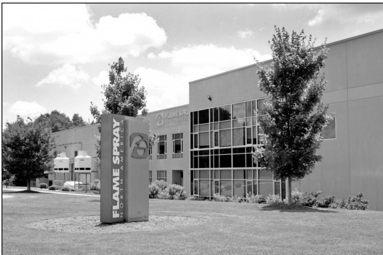
Flame Spray North America recently announced that they will invest $2.5 million to expand their operations in Fountain Inn, which will create 40 new jobs.

"Flame Spray North America is thrilled to continue to grow in Laurens