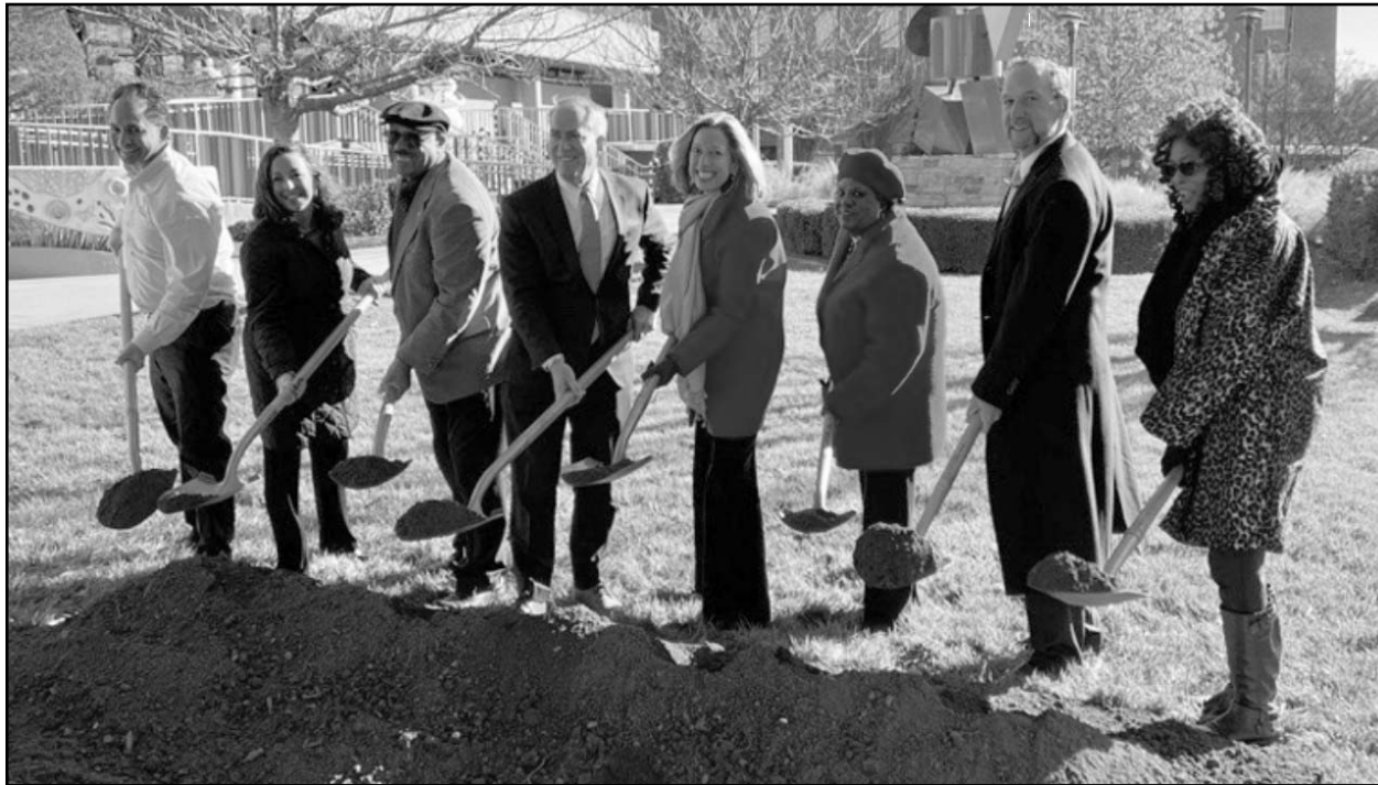
Greenville and state leaders recently broke ground on the $4.3 million Cultural Corridor road improvement project. The project should be completed by the end of 2024.