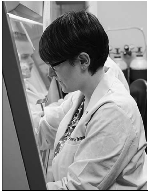
Researchers at the Edward Via College of Osteopathic Medicine (VCOM)-Carolinas, located in Spartanburg, are exploring a mechanism that the Ebola virus uses to shut down the body's ability to fight infection.

The Ebola virion contains a lipid membrane, called an envelope, and several different proteins. One of these proteins is secreted into the blood of infected individuals in especially high quantities. When the VCOM-Carolinas researchers examined this isolated protein, they found that it shut down specific immune cells called macrophages. Once disabled by the protein, the