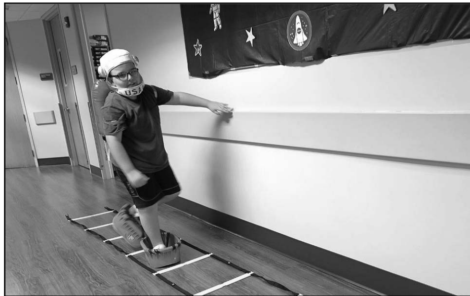
At Spartanburg Regional Pediatric Rehabilitation Services, play is incorporated into occupational, speech and physical therapy.

AAA Carolinas warns that this trend is dangerous for all parties involved, including those doing the dance in the street as traffic flies by, those recording it on their phone while also attempting to drive and those getting out of a moving vehicle. The distractions created by the In My Feelings Challenge are endless and come with severe consequences. Those caught participating in this global phenomenon could face legal action for those caught participating. For example, in Florida, violators face a $1000 fine for exiting a moving vehicle.