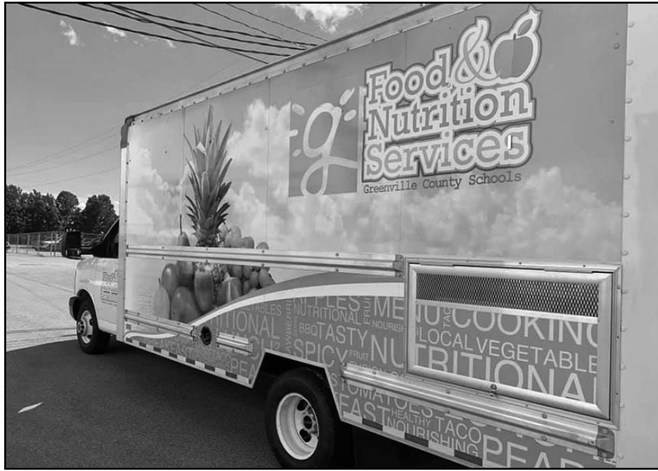
The food trucks serve free, nutritionally balanced meals to Greenville County children during the summer months.

The Riley Fellows known as the "Swamp Rabbit Express" donated a second food truck to Greenville County Schools as part of their service project with the Riley