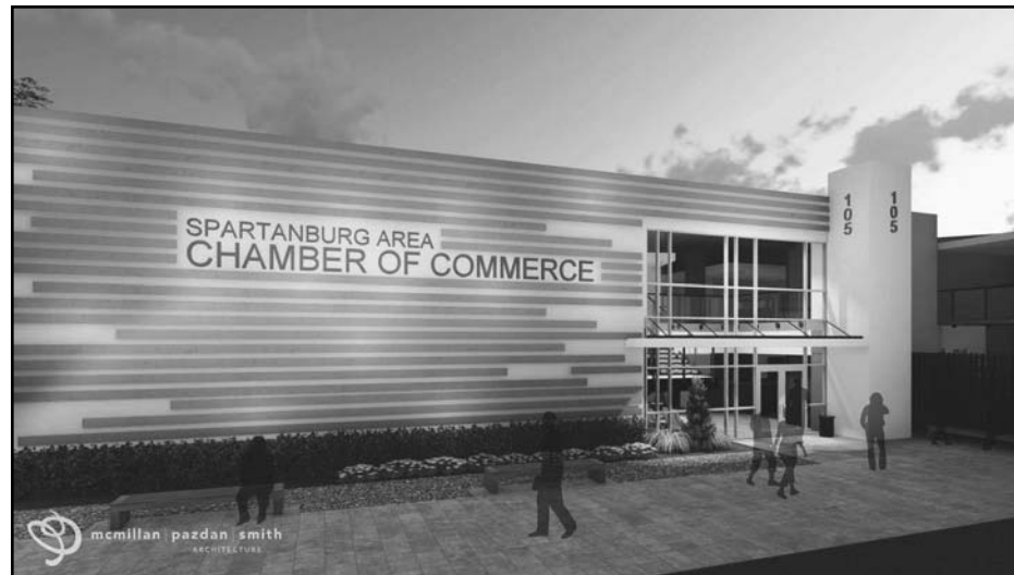
External rendering of the renovated Spartanburg Chamber facility.

A new option for the Fire Department will be needed soon, as both the City Police Department and City administrative staff will be vacating the current City Hall within the next few years as part of a joint facilities agreement with Spartanburg County. In 2017, Spartanburg County voters passed a 1 percent sales tax increase to fund a new County Courthouse and new facilities for Spartanburg County Administration, City Hall, and the respective police agencies for both County and City. However, fire department facilities were not included in the referendum, leaving the City to fund a new fire department facility on its own.