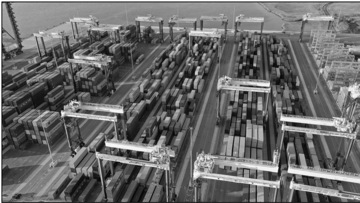
South Carolina Ports recently welcomed the first vessel to the Hugh K. Leatherman Terminal.

The Leatherman Terminal can efficiently work the biggest ships calling on East Coast ports. Phase One adds 700,000 TEUs of throughput capacity to the