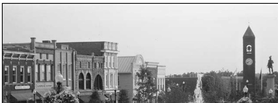
Spartanburg City Council voted 5-0 to approve the creation of a committee to make recommendations on physical enhancements to Morgan Square.

Admission is free, but tickets are required. Tickets are available via the event website only, https://www.davidjeremiah.org/tour and there will be an on-site will call on the day of the event. No ticket sales are available at the GSP International Box Office or via Ticketmaster.