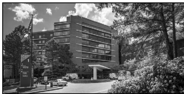
Spartanburg Medical Center was recently ranked as the No. 2 hospital in South Carolina by U.S. News & World Report.

pitals rankings and ratings, now in their 31st year, are designed to assist patients and their doctors in making informed decisions about where to receive care for challenging health conditions or for common elective procedures.