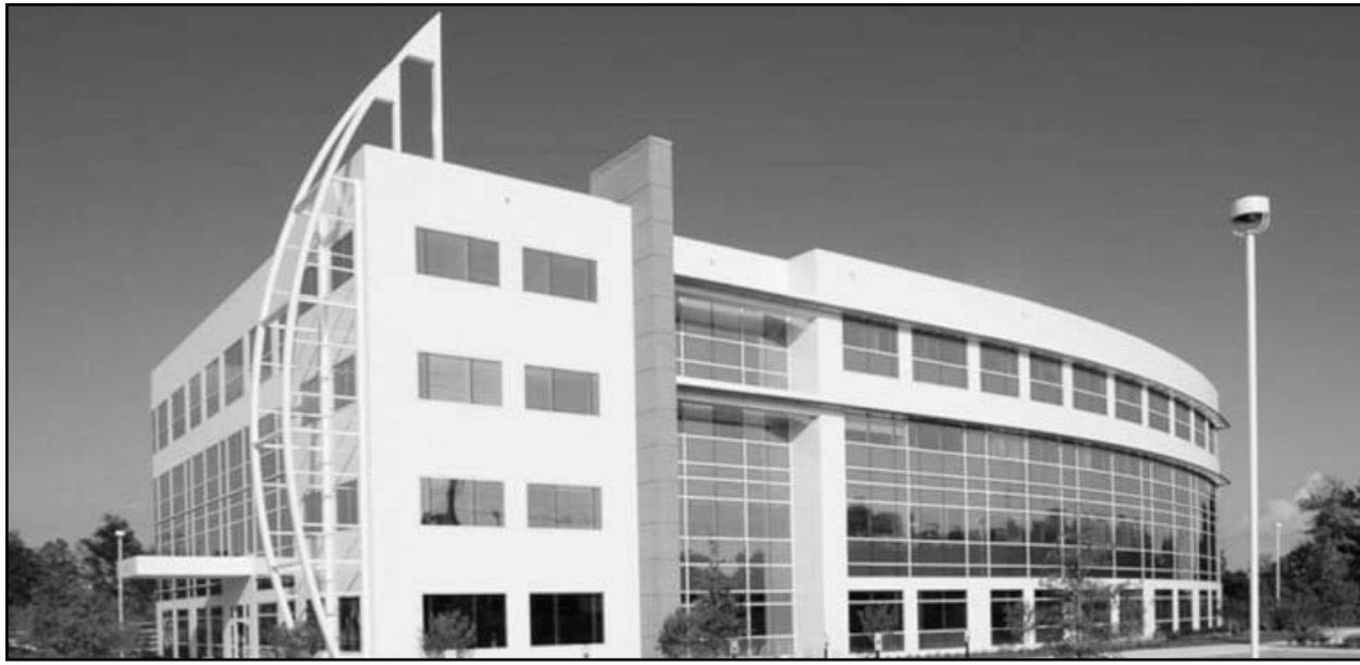
The Millennium Surgery Center at the Bon Secours St. Francis Millennium campus will offer outpatient ortho, spine & ENT procedures.

Bon Secours has been awarded a certificate of