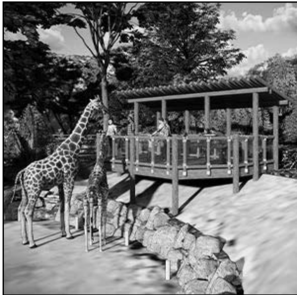
The Greenville Zoo was recently awarded $1 million in state funds to upgrade, renovate and expand animal exhibits.

"This funding allocation from the State budget reaffirms the importance of the Greenville Zoo to our community and to South Carolina," Councilwoman