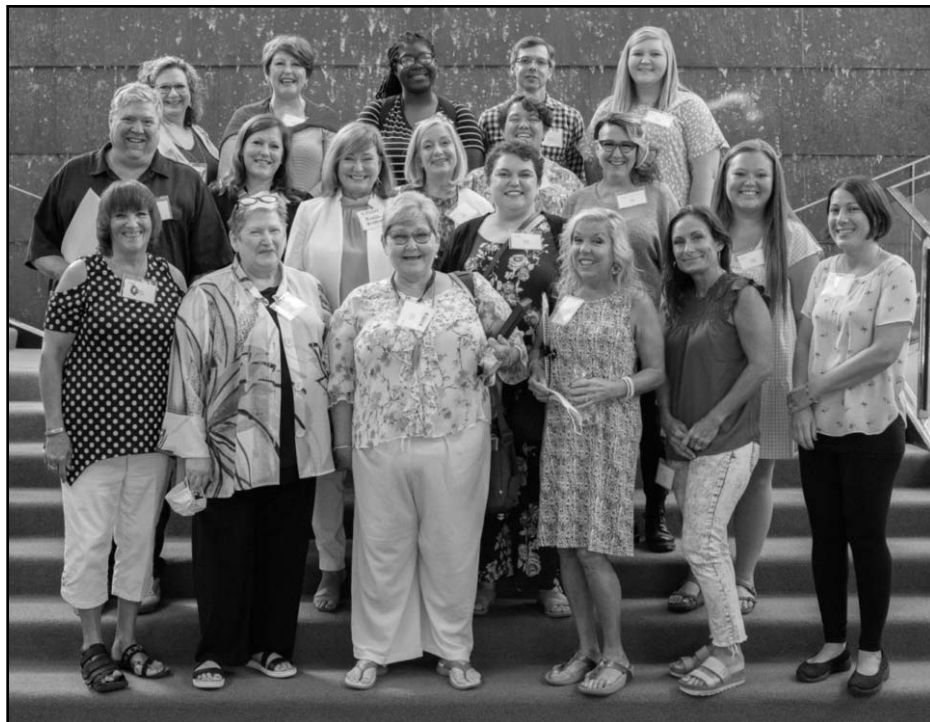
In June, Chapman Cultural Center led its 28th year of the Muse Machine STEAM Teachers Institute. As part of the Institute, educators from across the state participate in the week-long training that focuses on incorporating the arts into classrooms of various disciplines.

Participants will be given concepts to help them set boundaries, establish goals and expectations, provide feedback, and motivate team members. Visit https://www.eventbrite.com/e/buddy-to-leader-tickets-266311724537 for tickets.