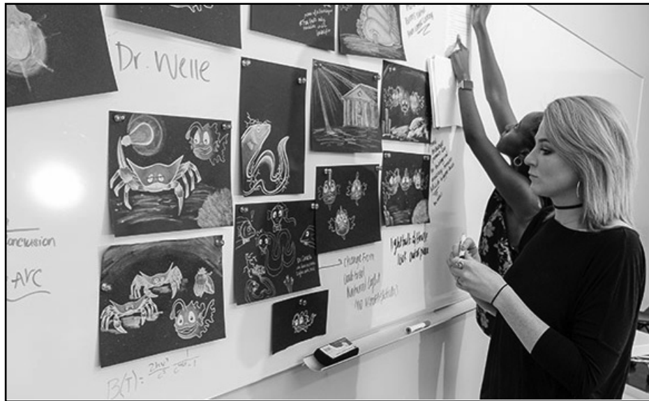
Wofford students have used summer undergraduate, faculty-mentored research experience to develop a children's book.

Upstate Counties included in the projects include Abbeville, Anderson, Cherokee, Greenville, Greenwood, Laurens, McCormick, Oconee, Pickens and Spartanburg Counties. Just over 80 miles on 62 highways in these counties will be resurfaced.