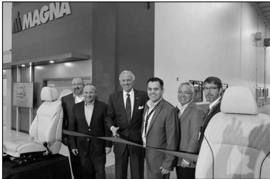
Magna officials were joined by South Carolina Governor Henry McMaster, members of local government and executives from BMW to celebrate the grand opening of Magna Seating South Carolina.

To achieve gold status, a company must confirm their skills through an in-depth verification process that requires multiple certified resources in each technical area, certified sales professionals, and numerous client references.