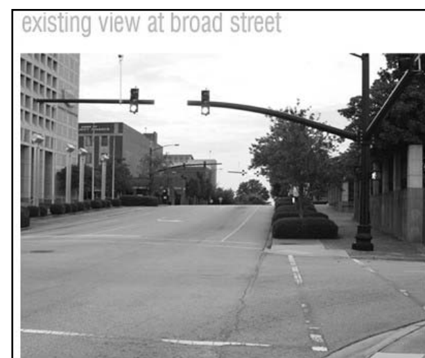
existing view at broad street

Construction on the .6-mile extension is expected to last through the sum-