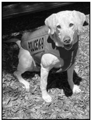
SCDNR's K9 Rio sports a new bullet and stab protective vest thanks to a charitable donation.

The S.C. Department of Natural Resources' (SCDNR) K9 Rio has received a bullet and stab protective vest thanks to a charitable donation from non-profit organization Vested Interest in K9s Inc. K9 Rio's vest was embroidered with the sentiment "In memory of K9 Gabo, Jonesboro, AR - EOW 1/16/20."