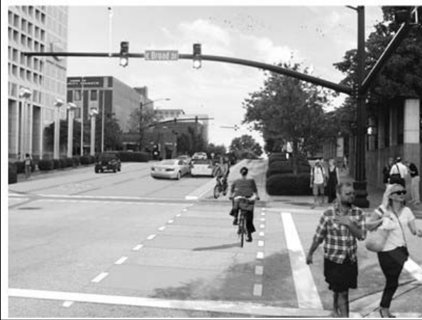
proposed view at broad street

mer, beginning with the section of Union Street between E Henry and E Kennedy streets. The street will be taken down to one lane for southbound traffic for the first phase of construction, which is expected to last up to three