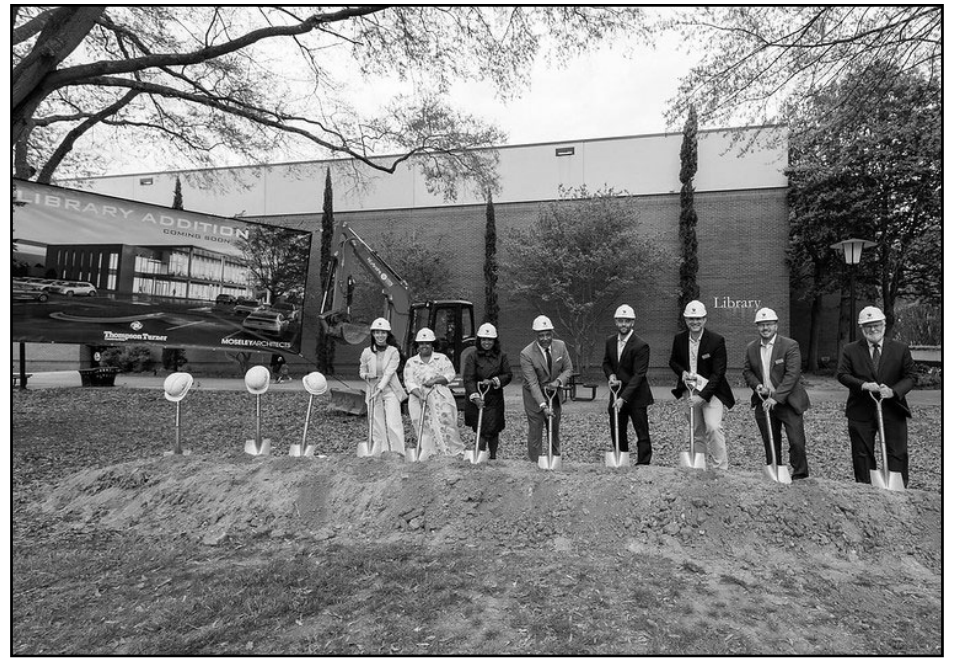
USC Upstate recently broke ground on a $21 million library expansion.