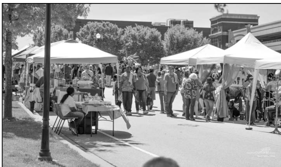
The Makers Market sponsored by Duke Energy will be set up where over 35 regional artisans will sell their wares. This is only one of the many things to see & do at Spartanburg Soaring! 2019.

Wofford was selected to participate in the CIC initiative through a highly competitive application process, with nearly four applications for each available spot in the program. Each institution will partner with a community-based organizations to engage members of the public on a topic of local importance.